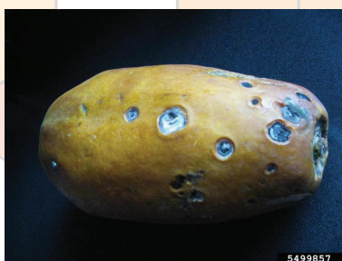
Alternaria Black Molds

Wherever papayas are grown, tools like pesticides are needed to fight disease, fungus and pests.