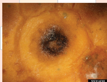
Bitter Rot and Anthracnose