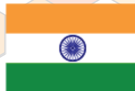
Republic of India