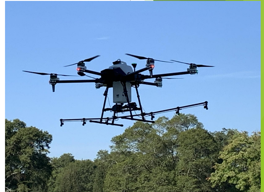
Drone specialized for crop input application